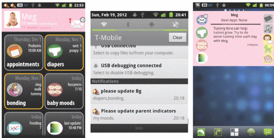
Figure 2. Screenshots of the different reminders embedded in Estrellita, from left to right: a) on the main screen, tiles that have an orange border (vs. a gray border) indicate that the parent has not recorded that particular data recently; b) nightly reminders show up in the phone's system tray which triggers a tactile and an audio alert on the phone; c) the Estrellita widget is placed on the phone's home screen and provides a quick glance of upcoming appointments, the latest message from the clinician or the virtual coach, and the visual cues of whether the parent has completed a particular bonding activity for that day (cues that have yellow backgrounds indicate that the activity has been completed; icons with a gray background mean that the activity has not yet been completed)

To facilitate communication between parents and clinicians, Estrellita provides glanceable charts that show a historical view of health data (Figure 1d). Individual data points on the graph are clickable to allow sharing of any notes parents may have attached to a recorded data point. All health data are also stored